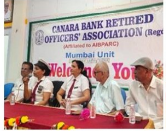
Speeches by the guests of honour