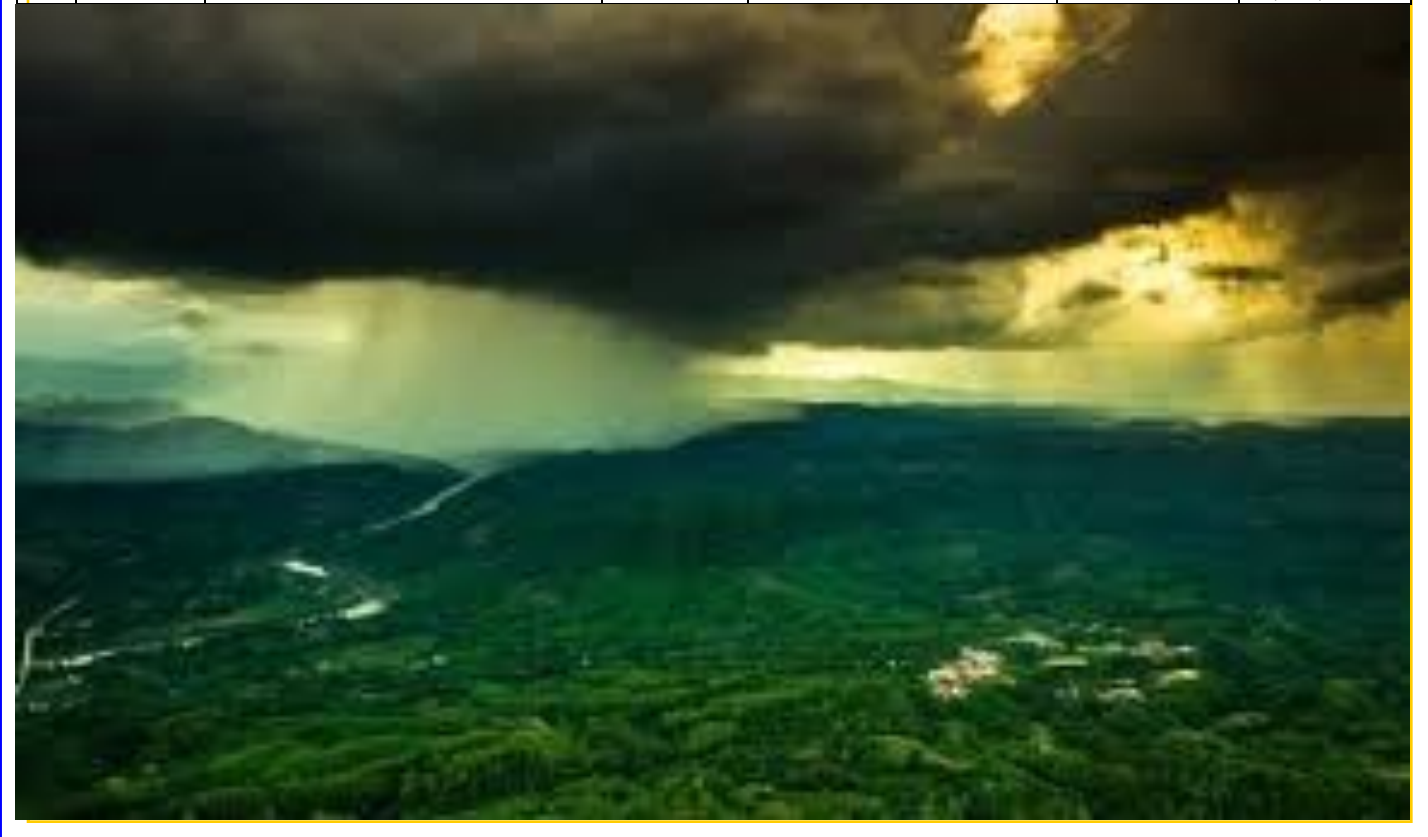
House Magazine of Canara Bank Retired Officers' Association (Regd)