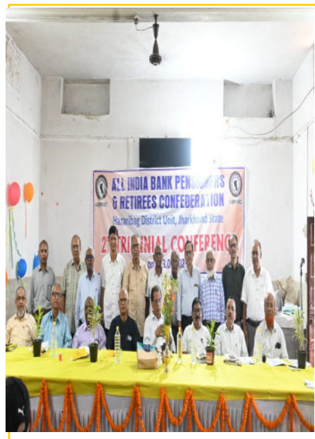
2nd Triennial conference of AIBPARC Hazaribag unit was at Hazaribag.