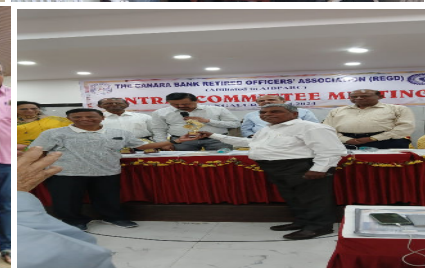
Odisha – Award Winner