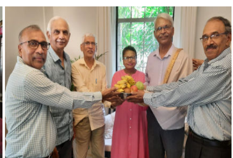
GOA FELICITATION PHOTOS