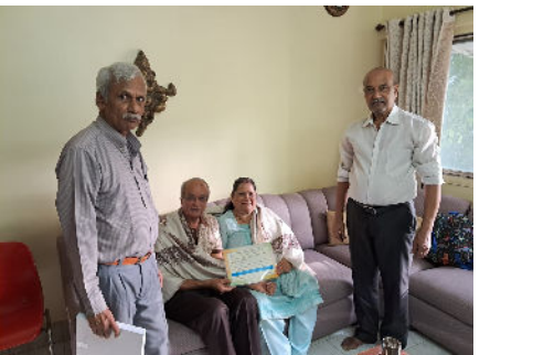
MUMBAI FELICITATION PHOTOS