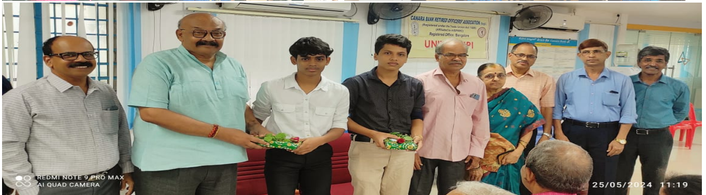
UDUPI FELICITATION PHOTOS