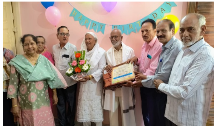
PUNE FELICITATION PHOTOS