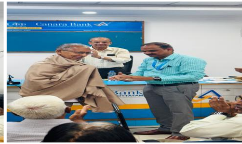
KERALA – KOTTAYAM