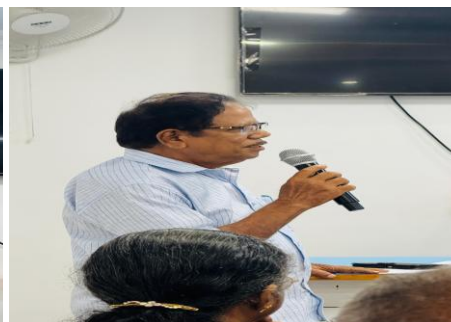
KERAALA - KOTTAYAM