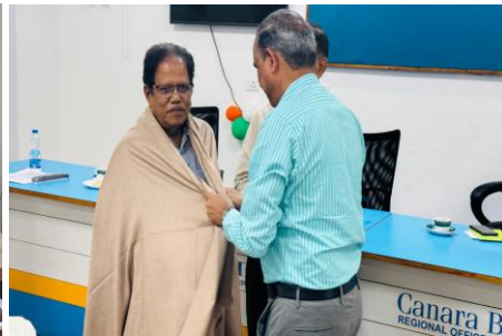
KERALA - KOTTAYAM