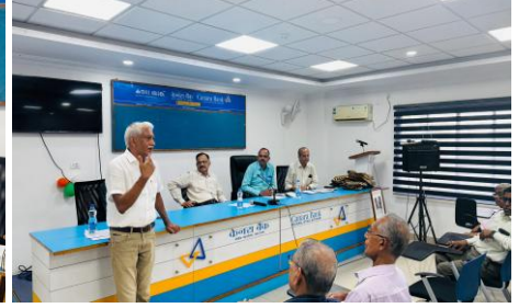
KERALA – KOTTAYAM