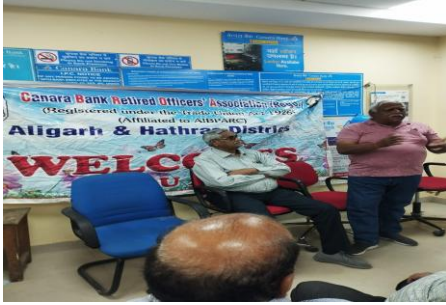
ALIGARH - HATHRAS