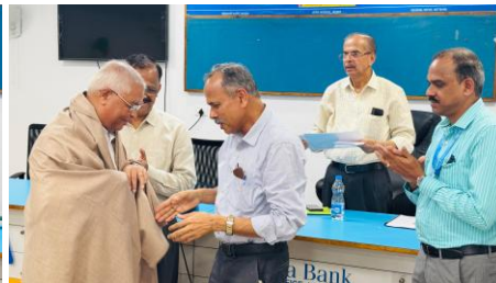
KERALA - KOTTAYAM