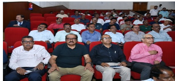
SNAPSHOTS OF PARTICIPANTS