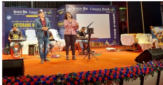
Music & Songs Programme

members are raising queries in non calculation of pension over stagnation increment as per 11th bipartite wage settlement. Our HRM collected the feedback in writing from our members. This year our HRM section invited members individually over Phone and by email. We have got wholehearted support and cooperation from our Circle Head, Executives and HRM Section. Also highest number of CBROA members from across the state have actively participated the retirees Meet on 19022025. CBROA Odisha Unit gave Vote of thanks to all who have participated the meeting, ICMR, Caterers and our Circle Office for organizing the Mega Veterans Meet 2025 at ICMR Auditorium Bhubaneswar