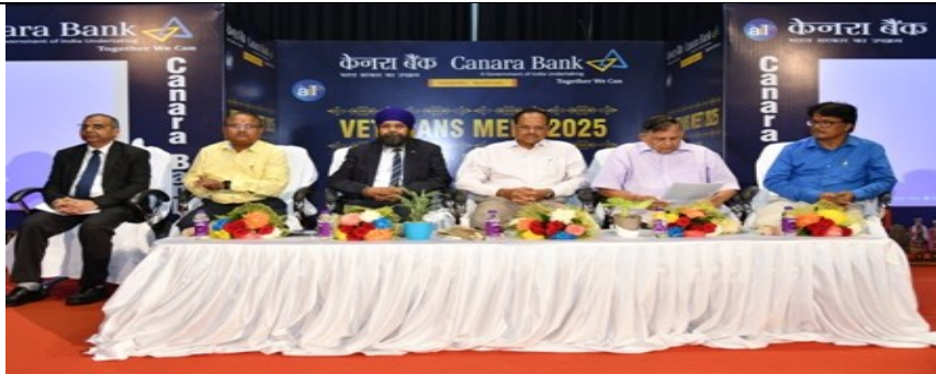
Lighting the Lamp, Floral Tribute to Lord Jagannath & the Founder and Guests on the Dais