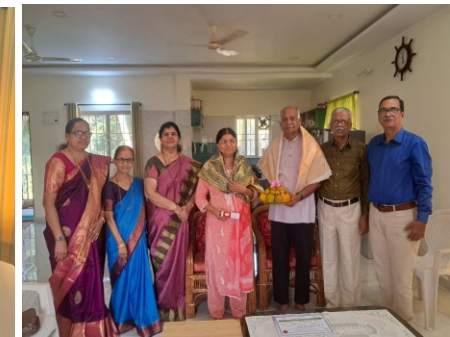
UTTARA KANNADA REGION