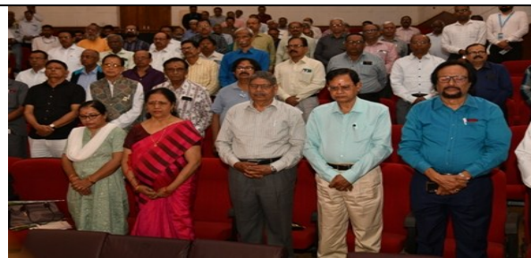
Silent Prayers for the Departed Retirees

Silent prayers in memory of the departed Members/Colleagues then & now