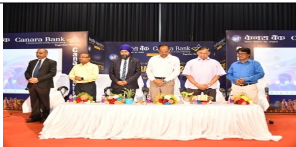
Silent Prayers for the Departed Retirees