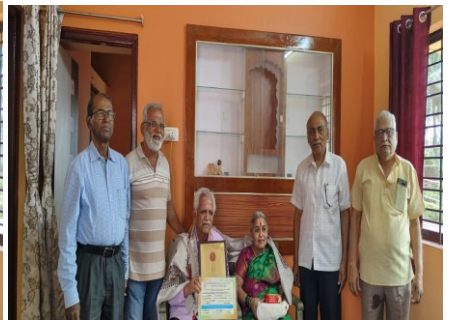
HUBBALLI - DHARWAD REGION