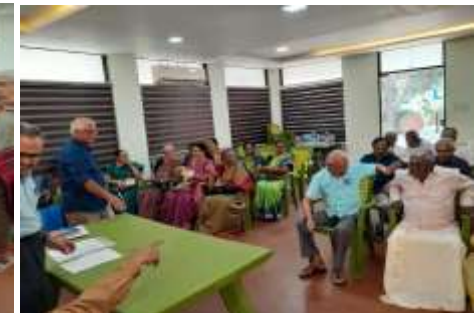
KERALA - KOLLAM DIST