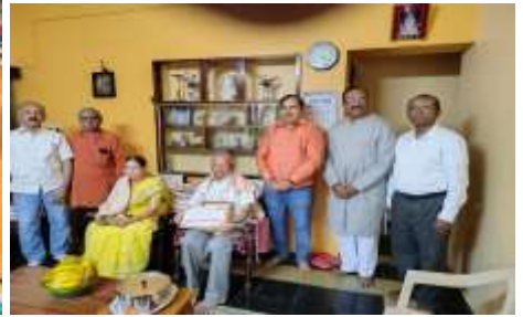
HUBBALLI - DHARAWAD REGION