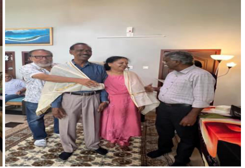
KERALA REGION - KOZHIKODE DIST