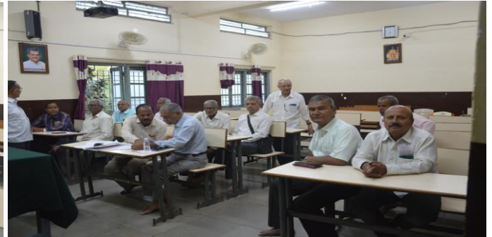
VIJAYAPURA REGION AIBPARC PHOTO