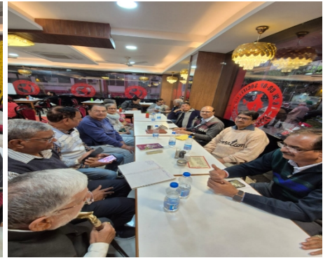
MADHYA PRADESH REGION